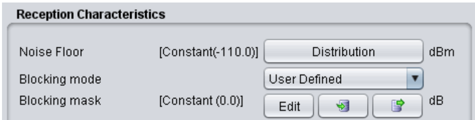
Figure 287: Example on how to import/export to/from the workspace/library for the receiver blocking mask

Note 2: It is possible to create a blocking mask from the workspace and export it to your library environment.